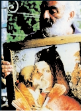
October 16-November 20 SERGEI PARAJANOV EXHIBITION