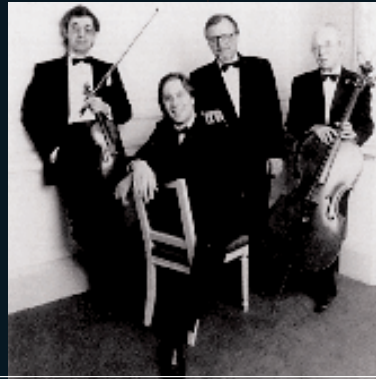
October 14-15 BORODIN STRING QUARTET