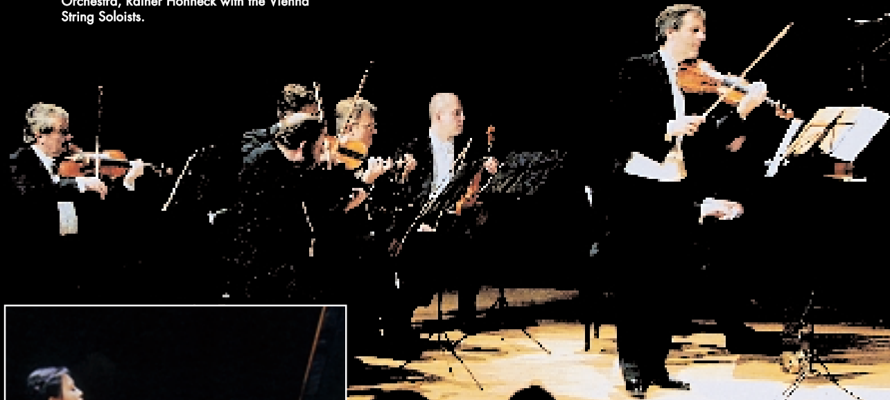
Concertmaster of the Vienna Philharmonic Orchestra, Rainer Honneck with the Vienna String Soloists.